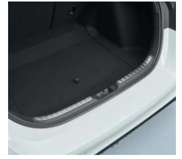
BOOT SILL DECORATIONS

A practical and stylish accessory for the boot. They protect against scratches and bumps. With an attractive brushed stainless steel finish, it fits perfectly onto the boot's lining.