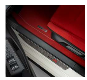
CARBON DOORSTEP GARNISHES