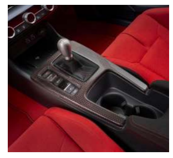
CARBON CENTRE CONSOLE PANEL