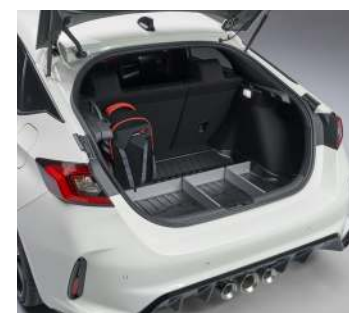
BOOT TRAY DIVIDERS