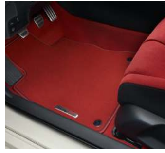
ELEGANCE FLOOR MATS

Red — These elegant and comfortable fitted tufted carpets, with a red nubuck binding, have a metal Type-R emblem for durability. One set includes: front and rear mats.