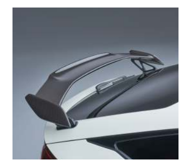
CARBON WING SPOILER