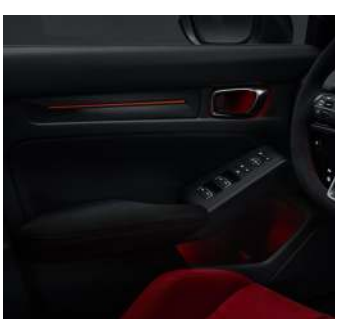
DOOR LINING ILLUMINATION