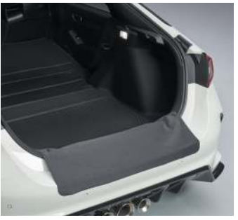
FOLDABLE BOOT MAT

Offers protection to your boot and to the complete loading floor in case the rear seats are folded down. Reversible - tufted carpet on one side, water repellent anti slip pattern on the other.