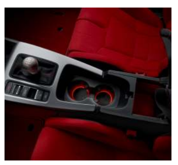
CUP HOLDER & CONSOLE ILLUMINATION