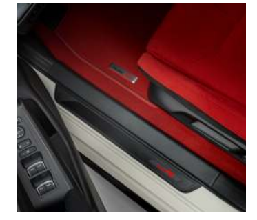
RED ILLUMINATED DOORSTEP GARNISHES

Crafted in black brushed stainless steel with a red illuminated Type-R logo. They protect the doorstep garnishes from marks and scratches. The kit includes illuminated front and non-illuminated rear trims.