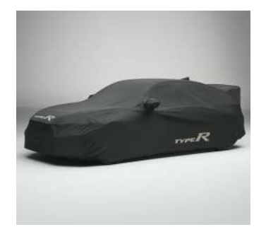
FULL BODY COVER*

Honda genuine accessories have been designed and built to the same exacting standards as every Honda. So they are durable, safe, secure and guaranteed to fit. All you need to do is choose what's right for you.