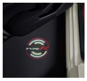
ILLUMINATED TYPE-R PATTERN PROJECTOR

By opening the front doors, the Type-R pattern is projected on the ground with a bright white and red glow creating more visibility in the dark when getting in and out of your car.