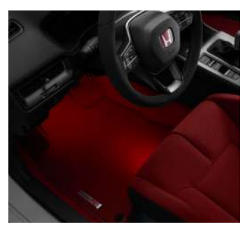
FRONT FOOT & UNDER SEAT LIGHTS